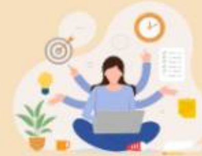
Self management skills